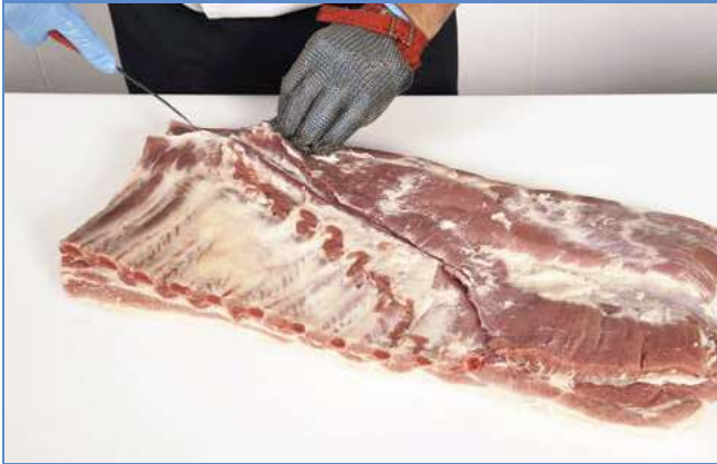
1 Rindless belly of pork.