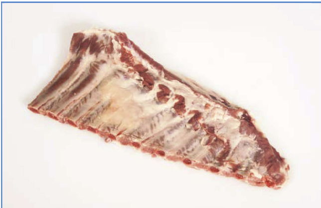
4 Spare Ribs – belly.