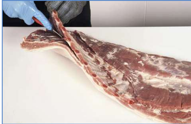
2 Remove the breast bone.