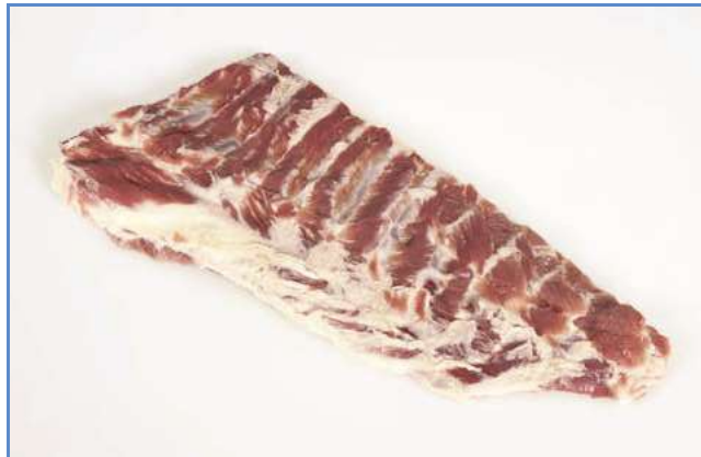
5 Cut between the ribs to create individual portions.