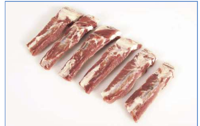
6 Spare Ribs – belly, individual.